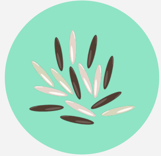
Wild Rice 1 cup 7 grams