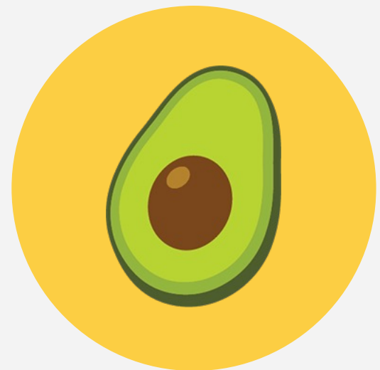
Avocado 1/2 avocado 2 grams