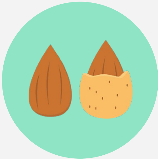
Almonds 1/4 cup 8 grams