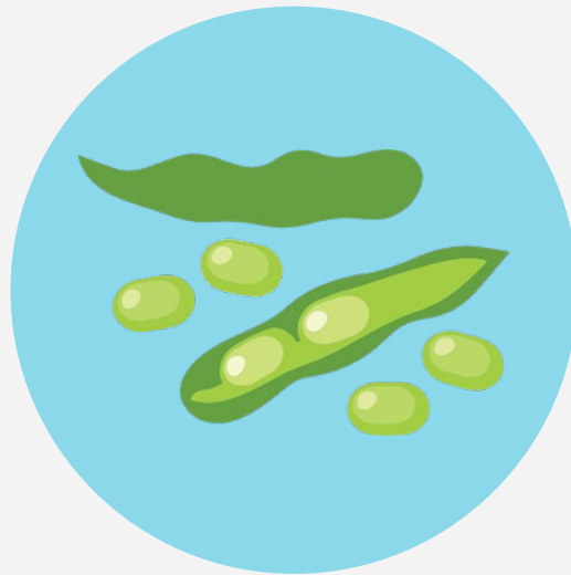
Edamame 1 cup 17 grams