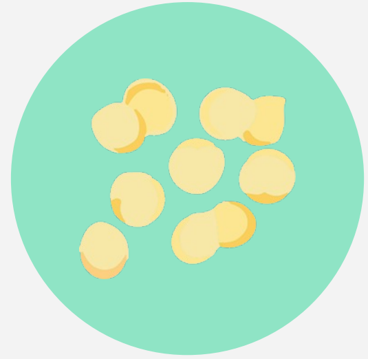
Quinoa 1 cup 8 grams