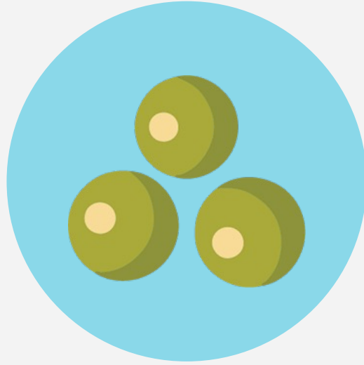
Peas 1 cup 8 grams