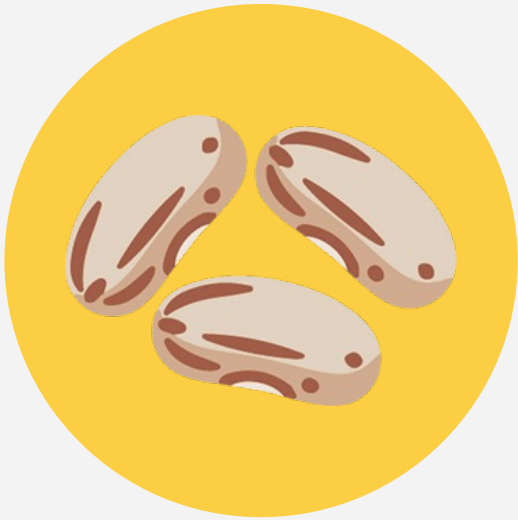
Pinto Beans 1 cup 15 grams