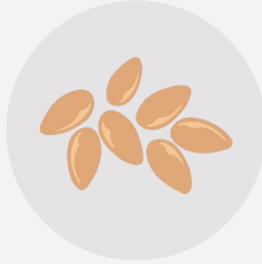
Flax Seeds 1 tablespoon 2 grams