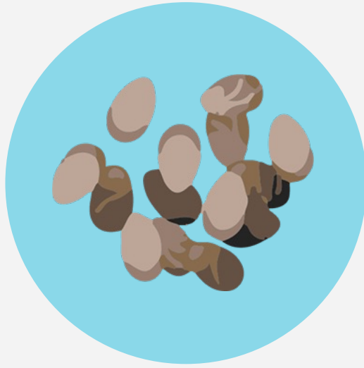
Chia Seeds 1 ounce 5 grams