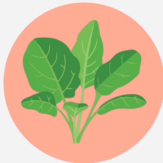
Spinach 1 cup 1 grams