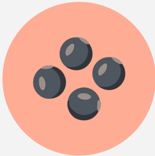
Black Beans 1 cup 15 grams