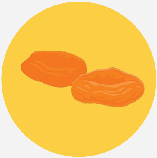
Dried Apricots 1/2 cup 2 grams