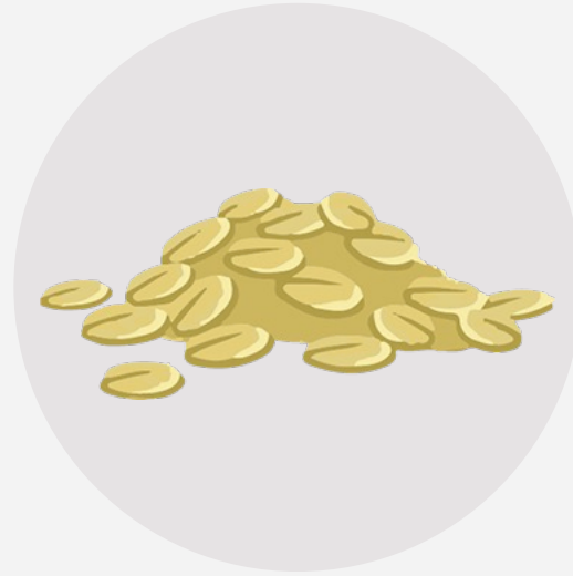
Oat Bran 1 cup 7 grams